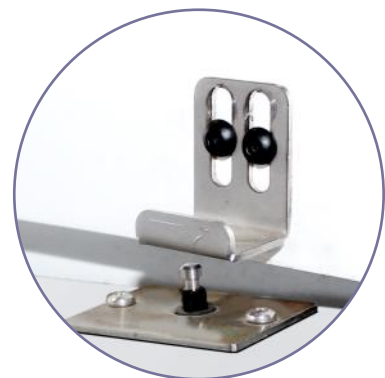
Hood safety latch