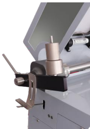
Automatic Cut-off Switch