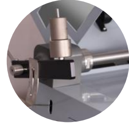
Down-feed facility with different weights upto 400 grms